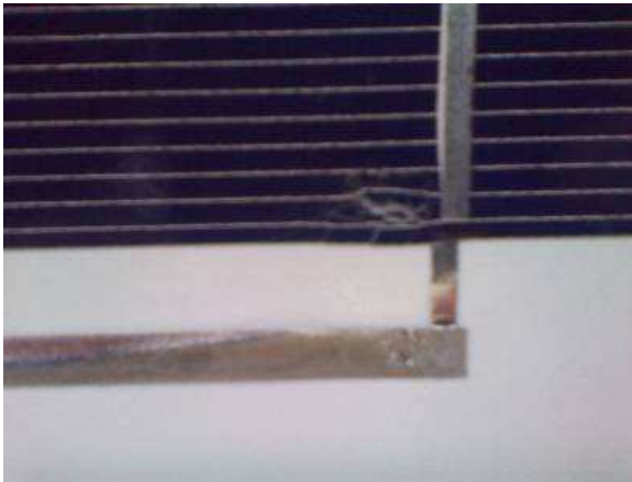
Figure 1: cell F10 of the sample # 201167 is broken near the bus bar.